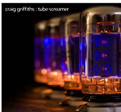
new album Tube Screamer due out in 2014

Carl Jah, solo and Dread Zeppelin Guitarist: